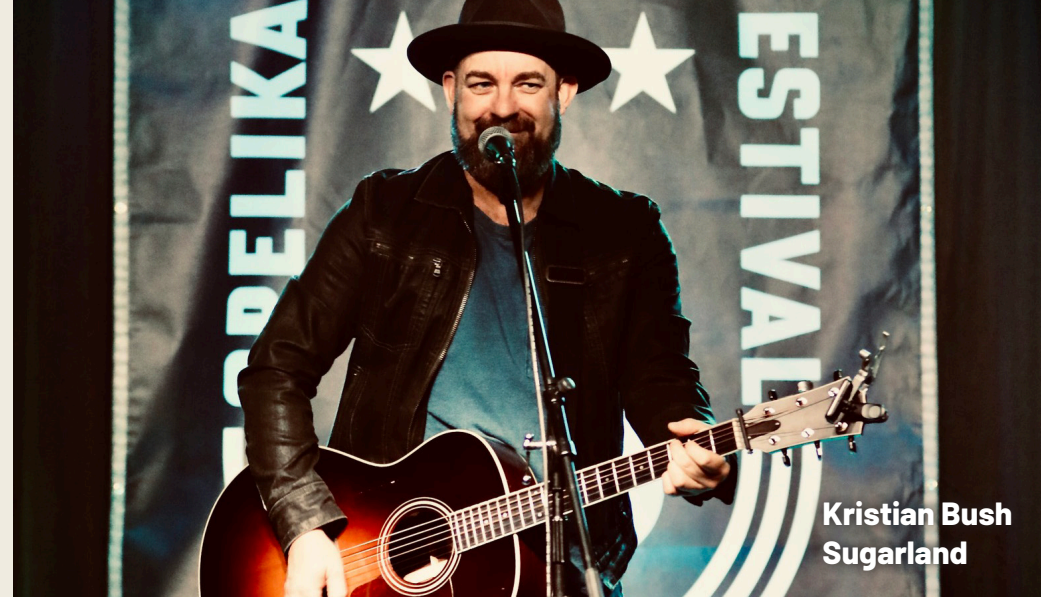
Kristian Bush Sugarland